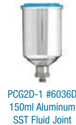
PCG2D-1 #6036D 150ml Aluminum SST Fluid Joint