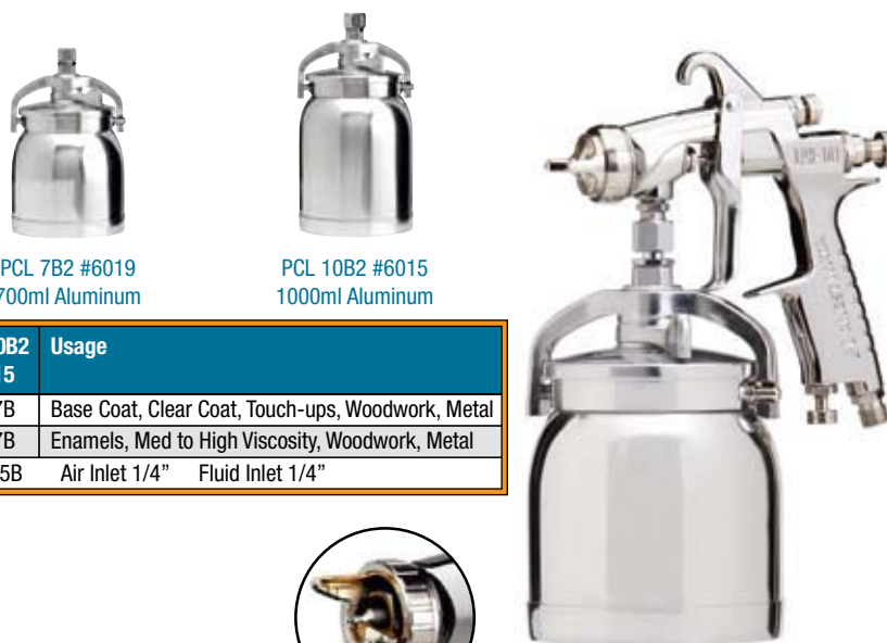
PCL 7B2 #6019 700ml Aluminum

High performance, compact and lightweight siphon fed HVLP spray gun.