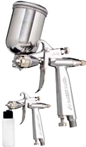
LPH101 shown with #6022 airbrush bottle adapter kit