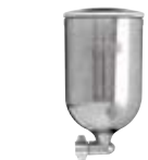
PC4S #6008 400ml Aluminum Cup