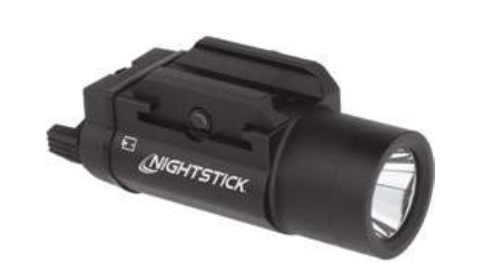
350L TWM-350 850L TWM-850XL